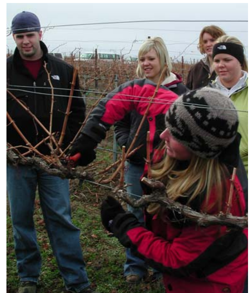
Wine Trade Professional Certificate students try their hand pruning vines while on a field trip to the Yakima Valley wine growing region.

To learn more about the program, please visit www.cwu.edu/wine-education/professional-certificate.asp