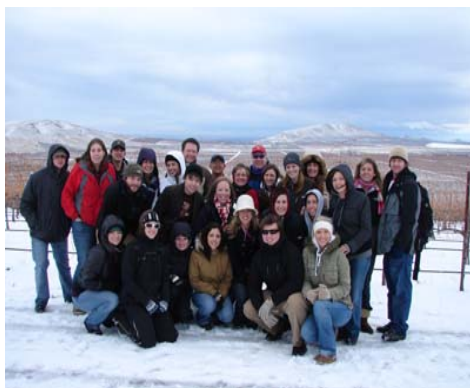
2008 Wine Trade Professional Certification Class